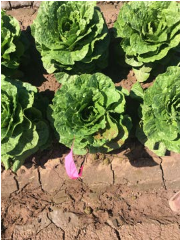
Figure 2. Example Animal Intrusion Contamination

E. coli TVS353. Prior to use, the fecal slurries were homogenized by vigorous shaking for 1 min. Slurries were stored at 4 degrees C for approximately 48-h prior to field inoculation. E. coli concentrations were confirmed using serial dilution spread plate method in duplicate; the concentration in each slurry was estimated immediately prior to field inoculation to confirm no significant growth or death of TVS353 occurred during the 48-h refrigeration hold. During each trial, romaine heads, furrows and beds were inoculated with 25 mLs of the composite fecal slurry per contamination. The slurry was applied directly onto the surface of each head of romaine, the furrow in the field, and or the bed in-between romaine heads. On average 0.5 mL of slurry inoculum contained 6.0 \times 10^7 E. coli TVS353 and 55 heads of romaine, furrow locations, or beds were contaminated across twenty beds of two-line romaine on a one-acre plot.