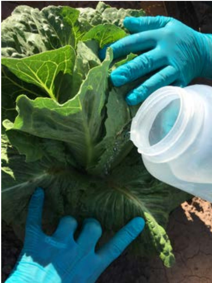
Figure 3. Example Furrow Irrigation Water Contamination

For each of the field scale contamination events, approximately seven days post contamination, the research team solicited support from industry to conduct standard pre-harvest sampling of raw product in each field. Accordingly, both an “S” (or serpentine pattern), and “Z” pattern were used to collect raw product samples from the field. An n of 60 was used to create a composite sample of approximately 1500 grams of romaine lettuce from each one-acre plot, collected in an 4L Whirl-Pak bag (Nasco, Fort Atkinson, WI, USA) by sample collectors. Sterile technique was used to prevent cross contamination and each sample collector changed all Personal Protective Equipment (PPE) in-between sample collections. This included changing and replacing gloves, Tyvek suits, and face shields for each sample collector. From each 1500 gram composite sample, four individual 100g sub-samples were assayed for E. coli TV353 by enrichment followed by direct spread plating of 100ul of sample enrichment onto ChromAgar ECC + 80ug/mL Rifampicin in duplicate. Positive results were recorded as blue colonies on each plate.