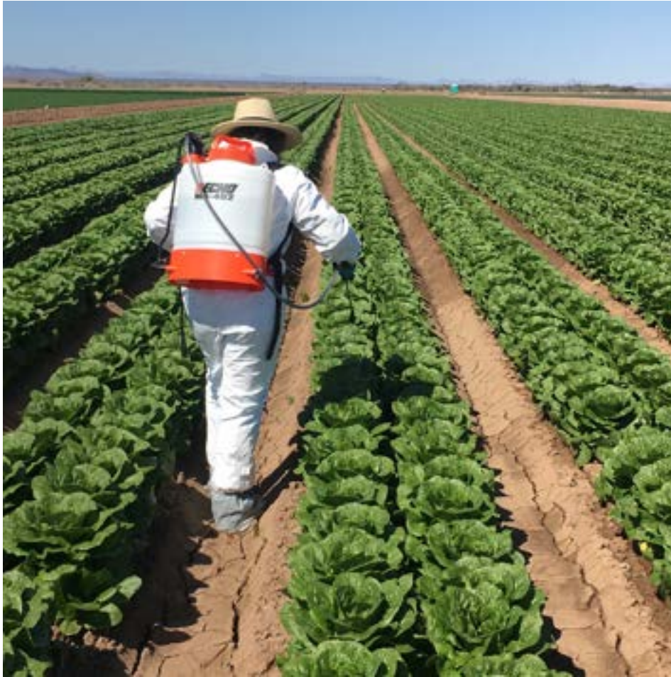
Figure 1. Example Aerial Application Contamination

For the contamination event simulating animal intrusion and subsequent fecal contamination, the research team followed protocols selected from published literature related to the creation of a fecal slurry (Chase et al. 2019). Fecal material was collected within 24 h of slurry construction from three species: horse, goat, and pig. These three sources of fecal material were selected for inclusion in this study because growers and researchers have consistently observed some of these wildlife species (feral pigs) intruding into agricultural fields of the southwest as well as ease of access to the species and their fecal matter. Feces used in the experiments were confirmed negative for E. coli O157:H7 and rifampicin resistant non-O157 E. coli . Fecal slurries (horse, goat, and pig) were constructed as described in Chase et al. (2019), modified using a fecal-PBS ratio of 1 g:4 mL. Briefly, feces and PBS were stomached in a 55-oz Whirl-Pak filter bag (Nasco, Fort Atkinson, WI, USA) using a Seward Stomacher 400 Circulator (Seward Laboratory Systems Inc., Bohemia, NY, USA) for 5 min at 230 rpm; the liquid portion was dispensed into a sterile flask, vortexed for 1 min, then inoculated with the target concentration of