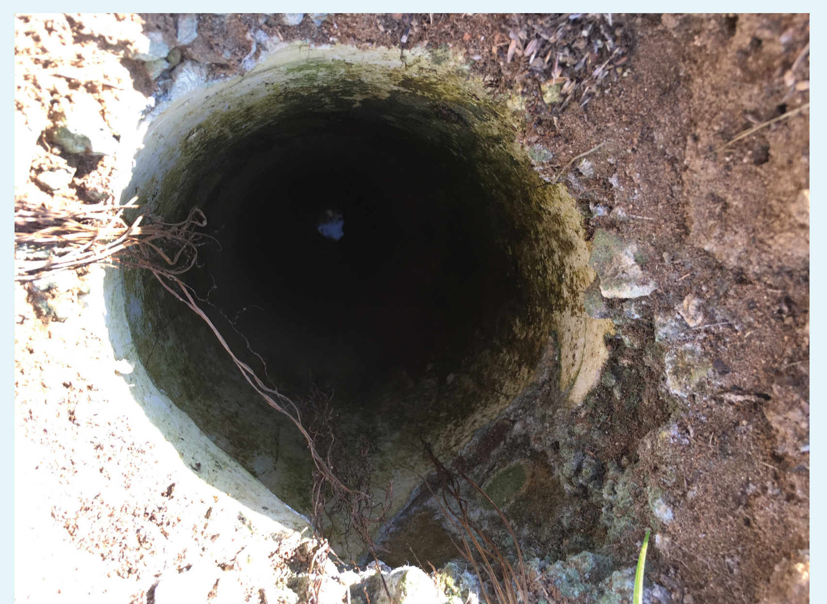
Figure 3: Groundwater well suspected of being under the influence of surface water