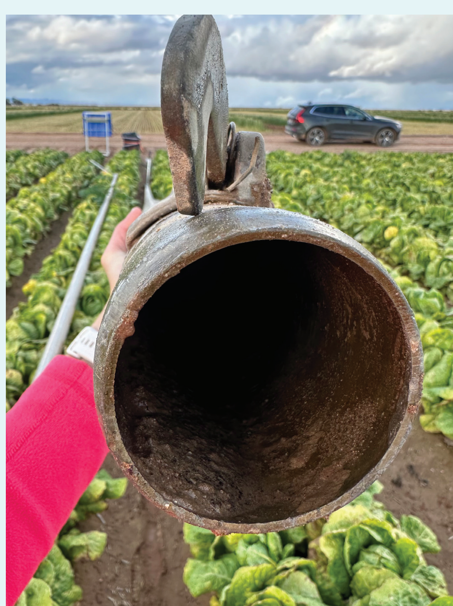
Figure 1: Cross section of aluminum pipe used for irrigation of fresh produce with surface water over one season showing substantial biofilm development and/or sediment accumulation.

This project aims to provide guidance to industry on the general process and field sampling methodology for determining hydraulic connectivity and acute/chronic distribution system contamination through water quality monitoring and boots-on-the-ground assessment in addition to suggested Best Management Practices to manage contamination.