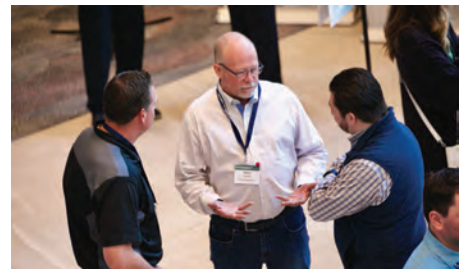
CPS's 2022 Research Symposium brought together diverse produce safety stakeholders to learn and network.