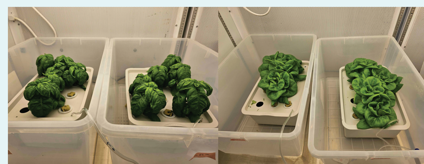
Figure 1: Growth chamber setup for basil (left) and lettuce (right) on Day 21 of the experimental trial. Individual tanks were connected to a continuous oxygen supply, and the nutrient solution (NS) was regularly monitored for changes in pH and electrical conductivity.

The CEA industry encompasses a variety of production systems, such as hydroponics and aquaponics. Although it is challenging for a single research project to address all types of CEA systems, this study takes an initial step by focusing on common processes and factors shared across most systems. This project aims to bridge key knowledge gaps related to food safety risks associated with recirculated NS, major types of GS, key lighting features for plant growth, and the impact of elevated humidity on the survival and transfer of human pathogens. The findings will directly support the development and implementation of best practices for managing NS, GS, lighting, and humidity, thereby mitigating associated risks.